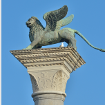
Status of a The Winged Lion, the chosen form of Obediah