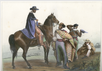
Vaqueros, the master of the herds