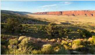
Praire of Duendes Heat