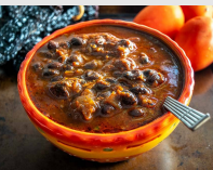
Meat with chilli