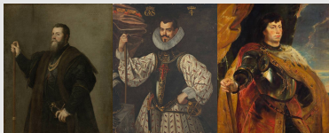
The Three Dukes of West Orelen