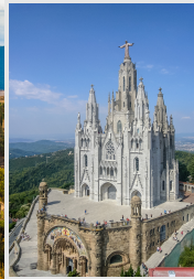
Temple to Obediah