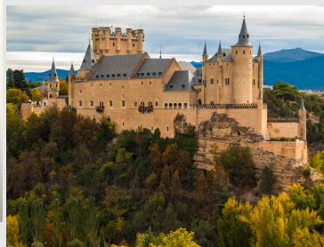
The Grand Castle of Scarrane

Out of the three groups the Port Oreleans are the most prominent in Altacala.