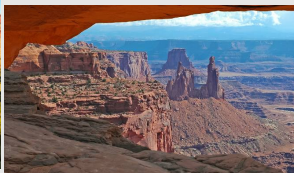
The Desert of Cresta Viva